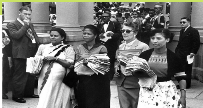
left to right Rahima Moosa, Lilian Ngoyi, Helen Joseph and Sophie Williams with their petitions at the Union Buildings, Pretoria

These are important lessons for us today. Let us build a sound nonracial society built on the principle of equity.